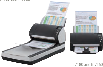
fi-7180 and fi-7160

fi-7160/fi-7260 – A4 Portrait at 300dpi 60ppm/120ipm fi-7180/fi-7280 – A4 Portrait at 300dpi 80ppm/160ipm Scan mixed batches up to 80 sheets