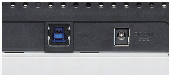
High speed performance through USB 3.0 interface

All four scanner models additionally make use of an ultrasonic sensor that accurately detects multifeed errors where two or more sheets are fed through the scanner at once plus intelligent multifeed function that is designed for documents that intentionally feature paper attachments of defined sizes or locations such as sticky notes or photos. The scanner can automatically recognise the location of the attachment and will then exclude that zone from triggering alert conditions.