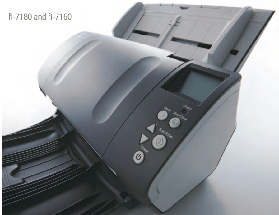
fi-7180 and fi-7160