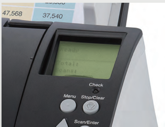
Integrated LCD operating panel

The fi-7180, fi-7280, fi-7160 and fi-7260 come with Scanner Central Admin tools that includes functions that system administrators can use to manage the installation and operation of multiple scanners, monitor operation status and update drivers and software from one location. This ability dramatically reduces the cost and work that goes into setting up, operating and maintaining many scanners in an organisation and also in expanding the scanner network to multiple locations.